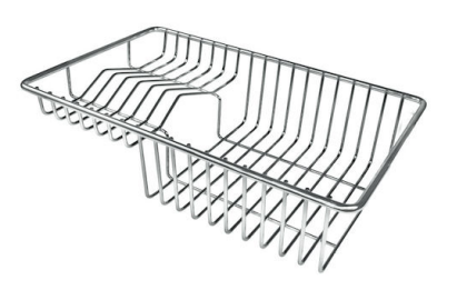
Stainless steel plate rack 8100 303 * only in combination with the accessory 8644 101